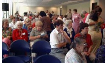
Supporters at Rockside's Open House.

Rockside Church's Open House was held Sunday, August 31 at 2:30 p.m.