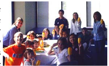
"Buddy barrels" are distributed to each child at Rockside Church.

Sunday, September 28 was the launching of BGMC in Rockside Kids Ministry. BGMC stands for "Boys and Girls Missionary Crusade" and serves as the missions giving outlet for the children of the Assemblies of God. Kids have the opportunity to save up change all month long in a special "buddy barrel." Then they bring their "buddy barrels" into service on the fourth Sunday of every month, which is missions Sunday in Rockside Kids. The kids learn about a specific country and pray for the missionaries and people of that country. We hope to establish a heart for missions in each of our children.