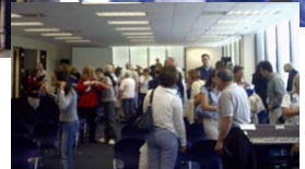
Sights from Grand Opening