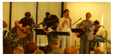
The Rockside Band opens the dedication ceremony at the Open House with a sample worship set.